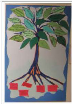
Beginnings of our Residents Charter

at the Trinity Theatre Gallery, Tunbridge Wells. It included displays of artwork that drew out our residents aspirations for their futures and what they liked and didn't like about what we do which will help us shape our future services. There was also a photo exhibition showing some of our residents, together with their own stories. The highlight of the evening was a talk by two of our residents that showed what a difference the programme has already made to them. A big thank you to Town & Country for sponsoring this event for us.