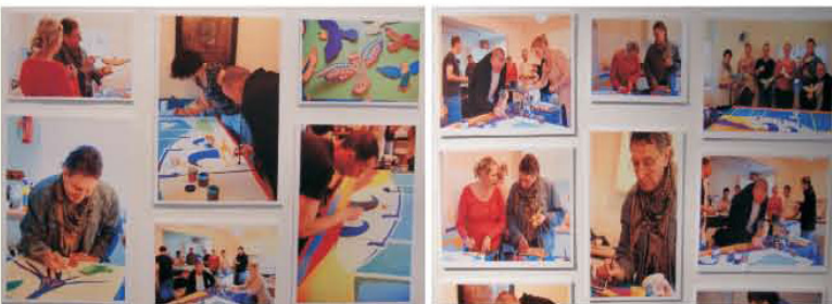
Residents Art Consultation Evening