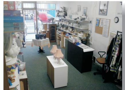
New Look Tonbridge Shop

In the past few months, our charity shops have undergone somewhat of a face-lift. Both now have long-overdue new flooring and the Tunbridge Wells shop has been decorated. The Tonbridge shop especially has undergone somewhat of a transformation and has been completely re-styled with a new counter, the upper part of the shop opened up for extra sales space and the clothing rails re-positioned to give a much more open and welcoming feel to the whole shop.